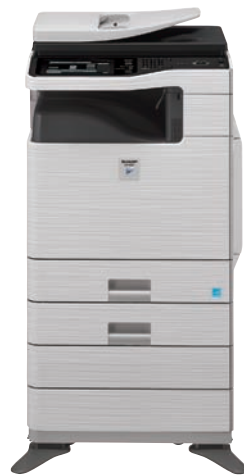
Base Unit Paper Drawer 2 x Stackable Cabinets Base Plate