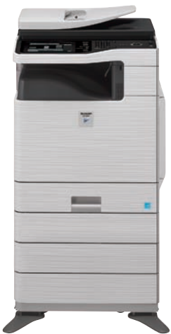
Base Unit 3 x Stackable Cabinets Base Plate