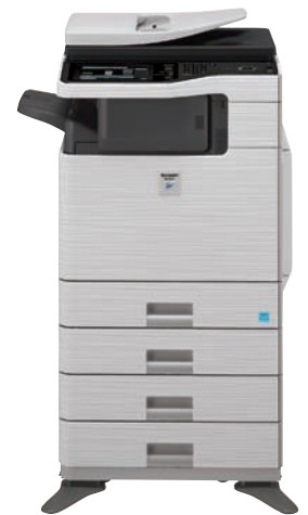
Base Unit Finisher 3 x Paper Drawers Base Plate