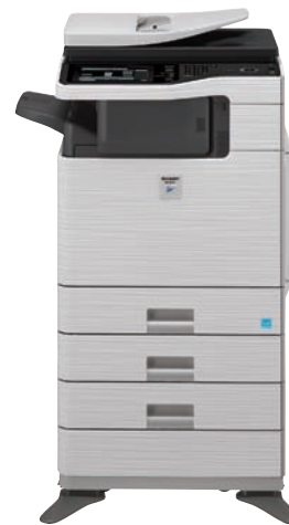
Base Unit Finisher 2 x Paper Drawers Stackable Cabinet Base Plate