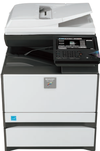
Shown with optional paper drawer.