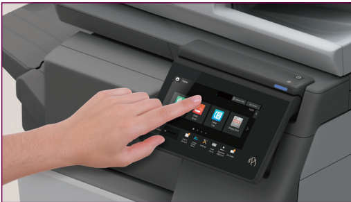
Sharp's award-winning user interface - designed to make life easier.

Our devices feature an LCD touchscreen control panel with Sharp's award-winning Easy UI*, which provides an intuitive display and easy access to commonly used functions. Or you can customise it to suit your own way of working simply by dragging and dropping the menu icons.