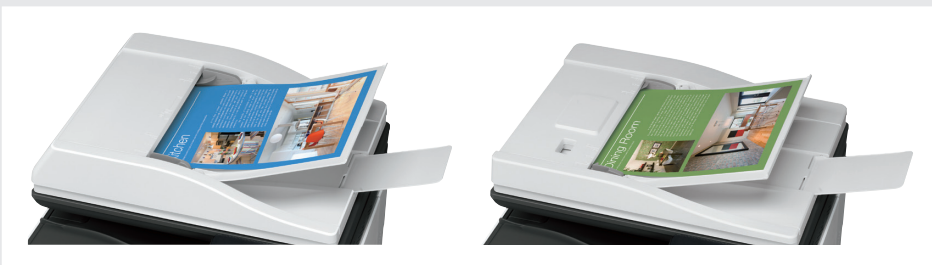
CHOICE OF DOCUMENT FEEDERS