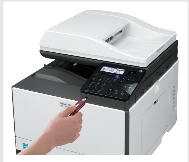
FRONT ACCESS USB PORT

Both models are equipped with a handy USB port for walk-up printing and scanning with a memory stick. And if you choose the MX-C300W, you can connect it to a wireless network and print wirelessly from your smartphone or tablet.