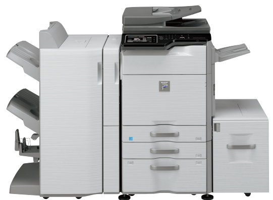
Base Unit Paper Pass Unit 4,000-Sheet Saddle Stitch Finisher Punch Module Stand with 500 & 2,000-Sheet Paper Drawers Exit Tray Unit Large Capacity Tray