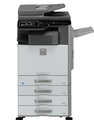
Base Unit Inner Finisher Stand with 3 x 500-Sheet Paper Drawers Exit Tray Unit