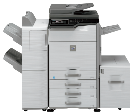
Base Unit Paper Pass Unit 4,000-Sheet Finisher Stand with 3 x 500-Sheet Paper Drawers Exit Tray Unit Large Capacity Tray